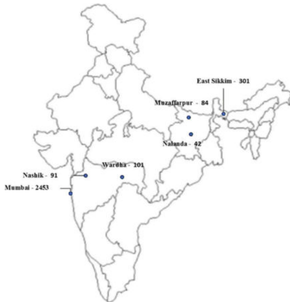
Figure 1. Location of districts covered under the study.